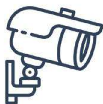
24/7 SECURITY SURVEILLANCE