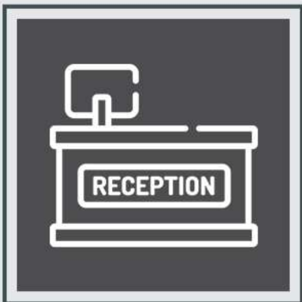
Concierge & Reception