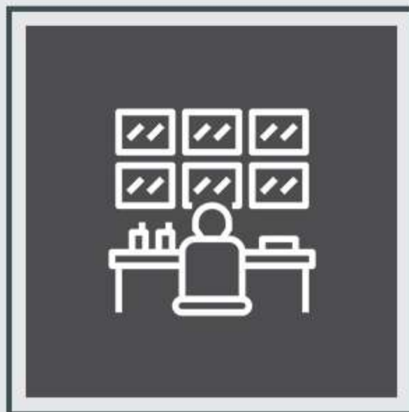
24/7 Security & Surveillance