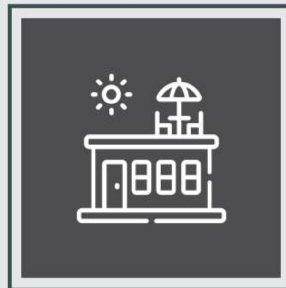
Rooftop Sitting Area