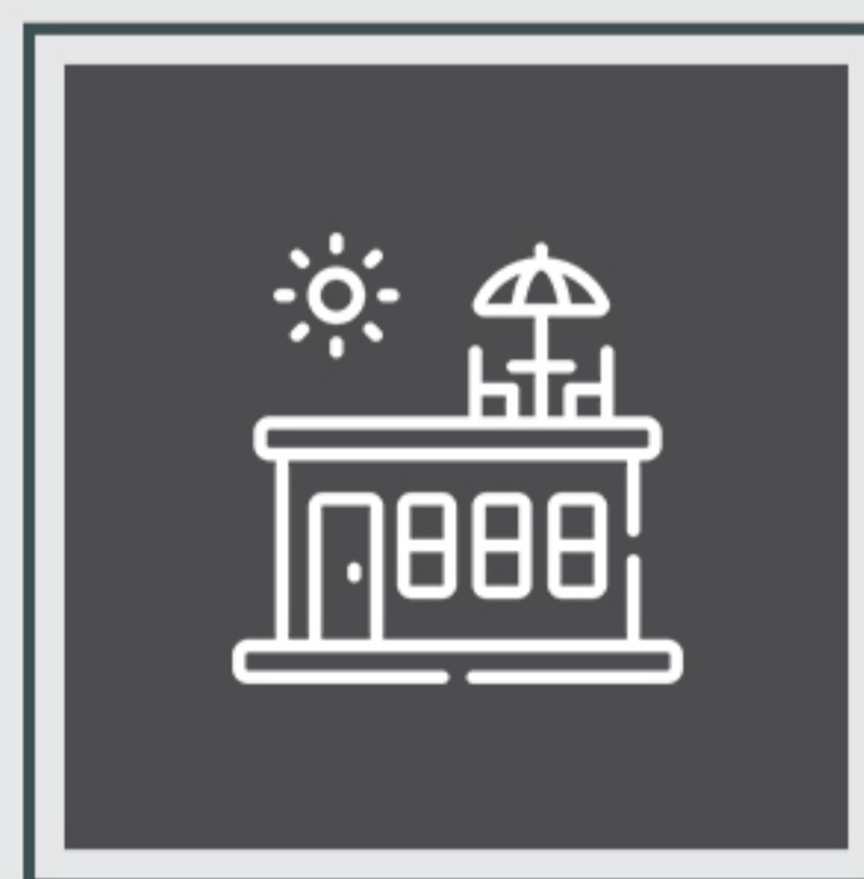
Rooftop Sitting Area